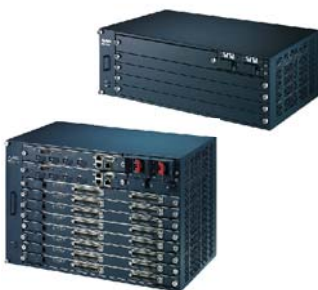
6.5U/4U IP DSLAM with DC Power

The compact design of IES-5005 offers a 4RU-height and 5-slot chassis-based system with a separated 3RU splitter frame. One slot is reserved for an MSC card and the remaining 4 slots are for DSL line termination cards and VoIP cards. The ADSL2/ADSL2+/G.SHDSL.bis and VoIP line cards have 48 ports while the VDSL2 line card comes with 24 ports. In a standard rack, you can install up to 10 units without a splitter chassis or up to 6 units with a splitter chassis. The IES-5005 supports remote terminal (RT) and uses the same MSC and line cards as the IES-5000.