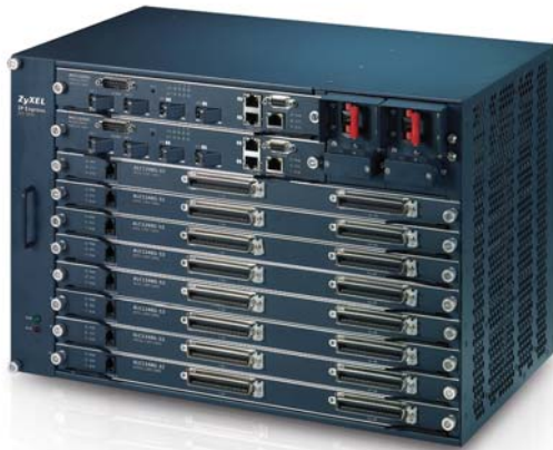
IES-5000 6.5U IP DSLAM with DC Power