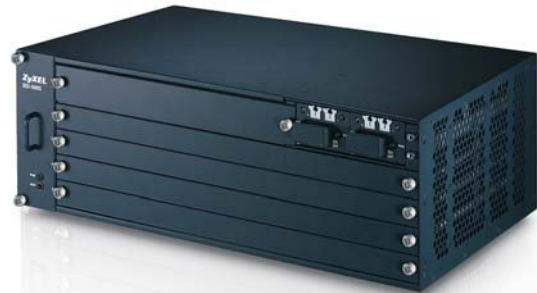
IES-5005 4U IP DSLAM with DC Power