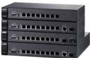
8-port Managed Layer 2 Fast Ethernet Switch